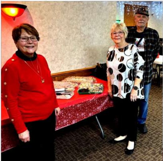
South Suburban Bridge Center players (above) enjoyed great food.