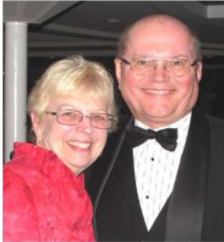
By Ginny and Jeff Schuett

Distributional hands are often hard to bid. In general, when you are 6-5 and your six-card suit is higher ranking than the five-card suit, you must start by opening in the higher ranking suit, the six-card suit. Then later in the bidding, depending on how the bidding develops, you hope to be able to bid your five-card suit twice, to show partner it is 5 cards, implying at least five, but often six cards in the first bid suit. So with a hand like