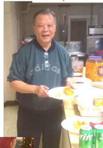
Naperville Duplicate Bridge Club players (above and left) had an array of goodies to choose from.