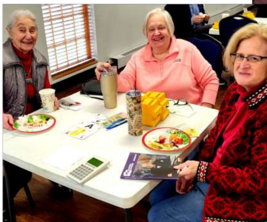
Players at Fox Bridge in Riverside (above and right) took time out to enjoy the food and to chat with others.